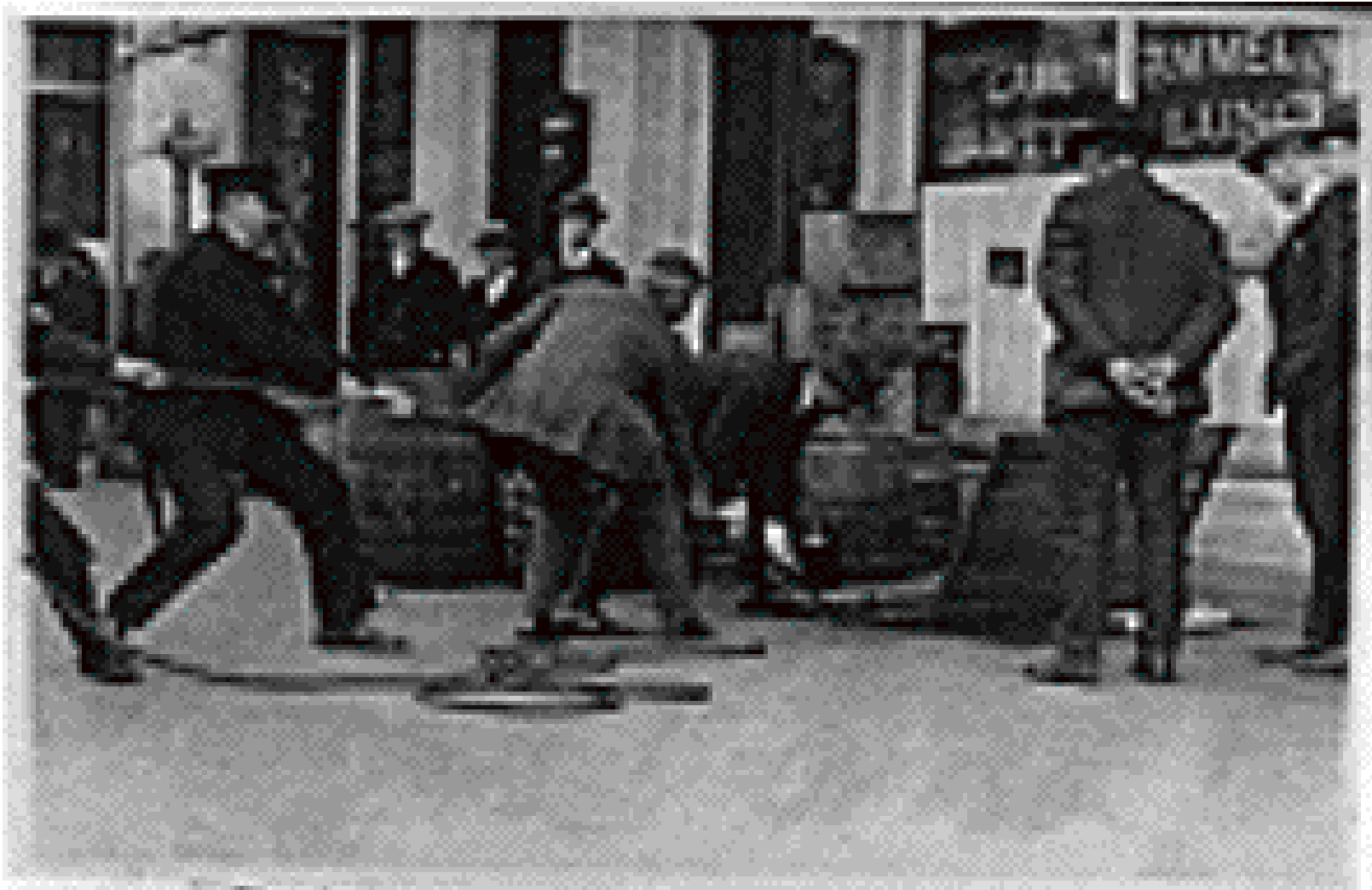
Prohibition officers raiding the Lunch Room of 2427 Pa. Ave Wash. D.C. 1929 4/24/29.

Police raid of a lunch counter suspected of housing a speakeasy.