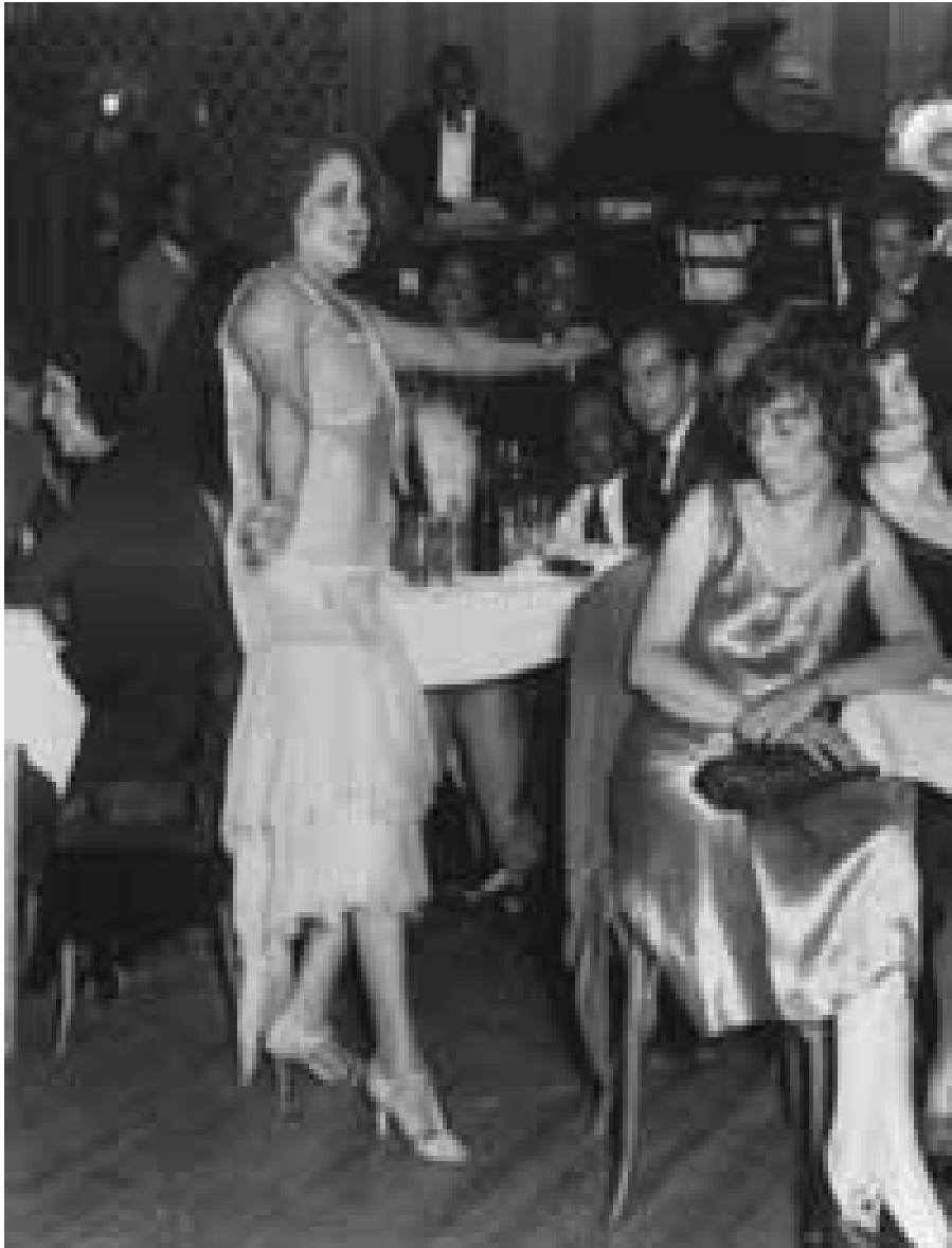
A Flapper in a speakeasy.