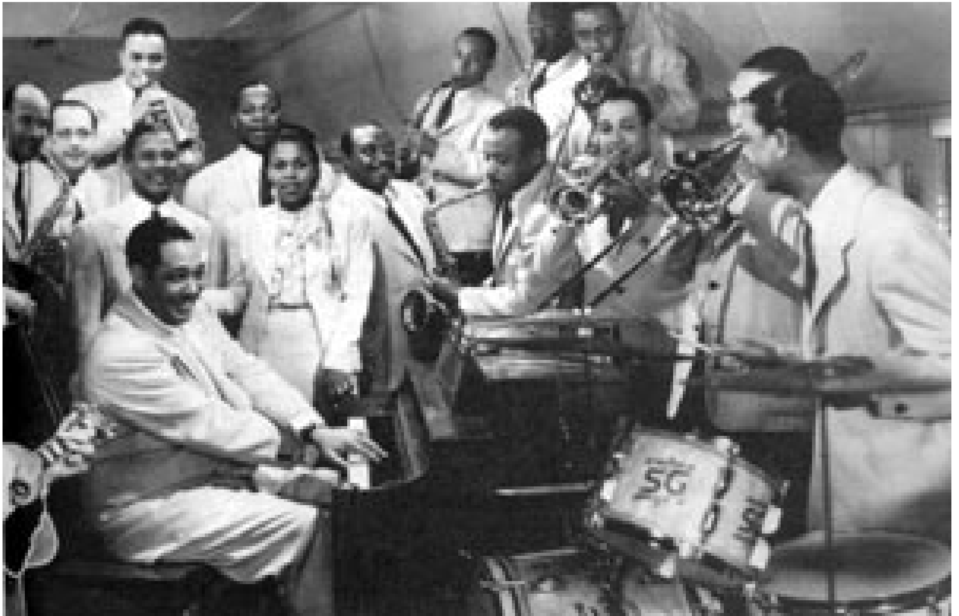
Duke Ellington and his Band 1927