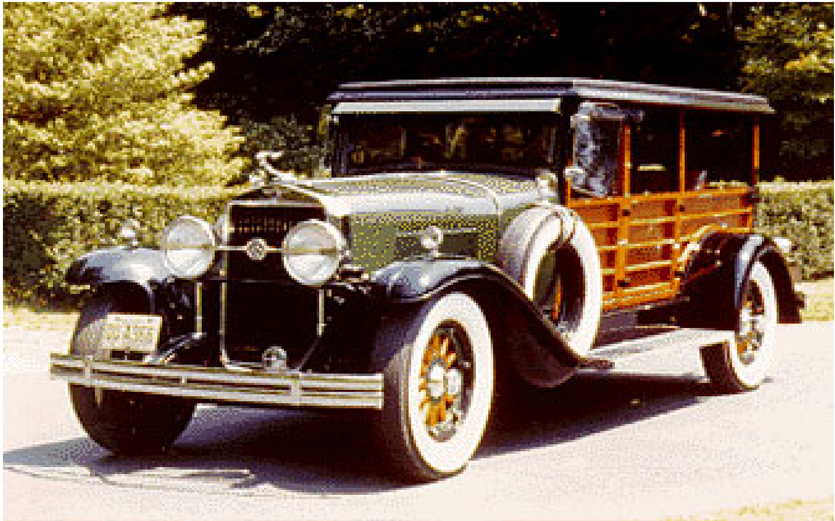
This 1929 LaSalle Series 328 with a one-off body by Cantrell of Long Island, was built for the owner of the Cadillac-LaSalle Agency in Newark, NJ. Powered by a 90-degree V-8 L-head engine, it has a synchro-mesh transmission and inboard mechanical brakes, new features for LaSalle that year.