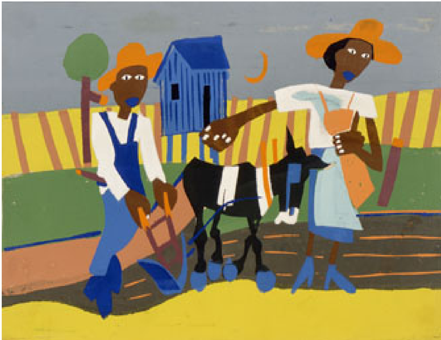
Sowing , ca. 1942 by William H. Johnson (American, 1901-1970)