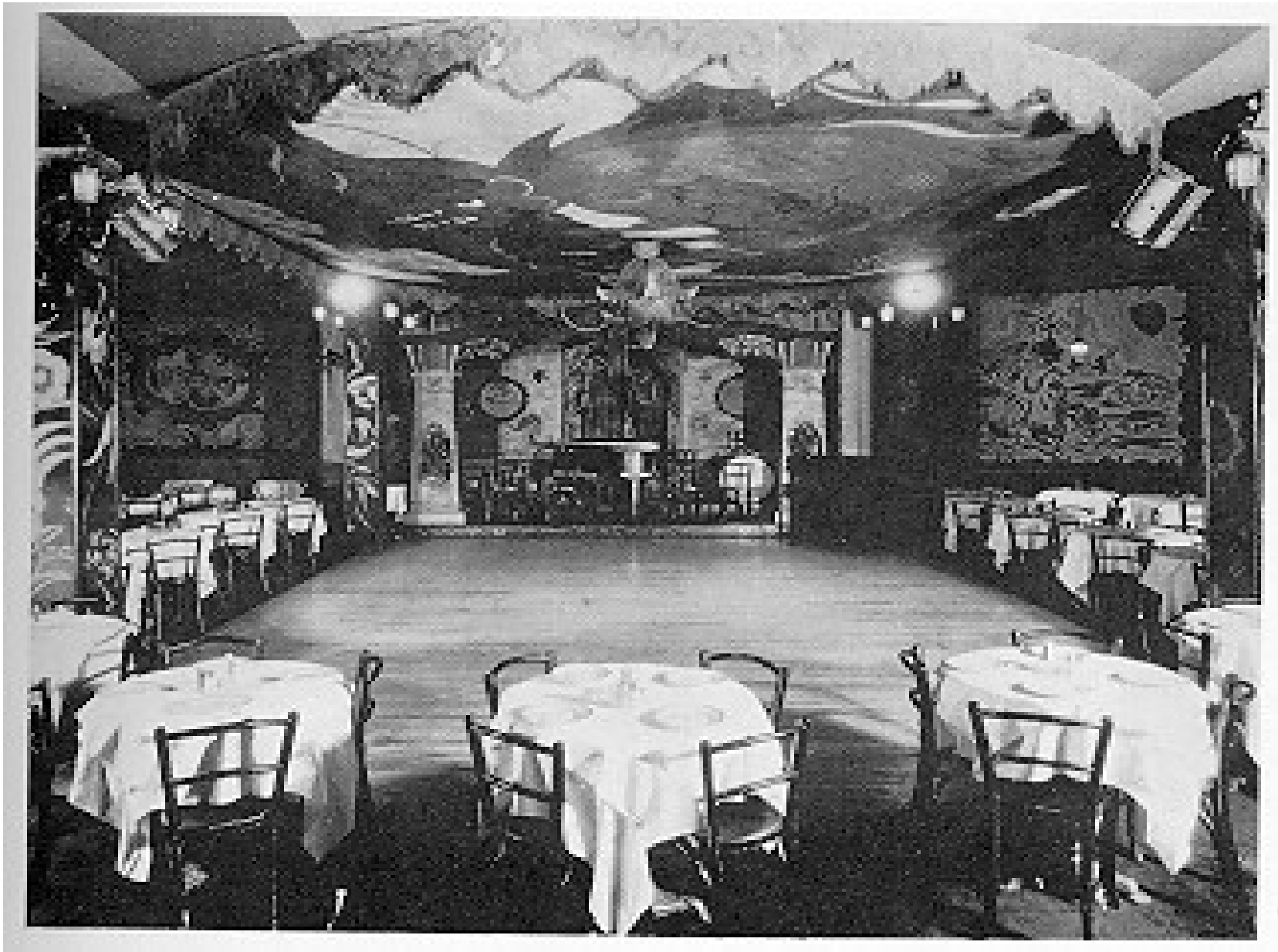
Connie's Inn, one of the Big 3 Speakeasies of the 1920's & 1930's