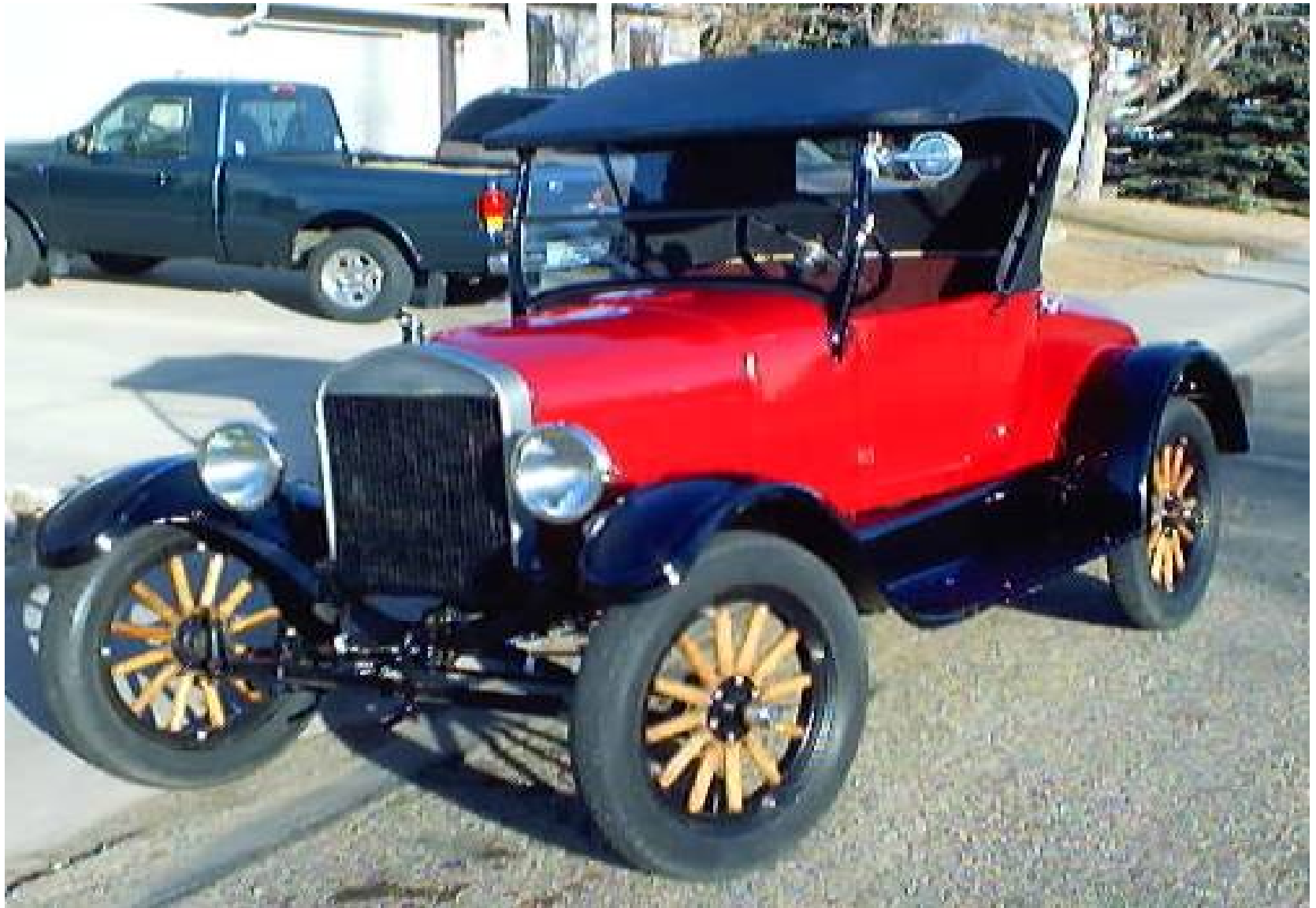
1926 "T" Roadster