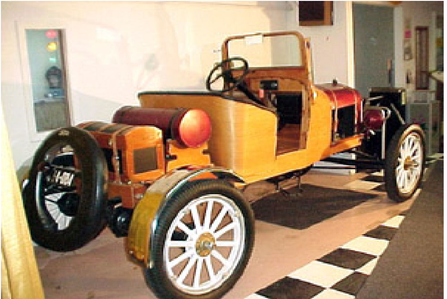
1921 Ford Model T with a birch speedster body patterned after a design found in an early 1920's Sears catalog.