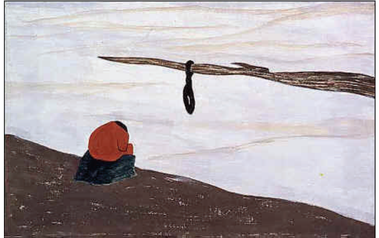
Jacob Lawrence, The Migration of the Negro, Panel 15, 1940-1941