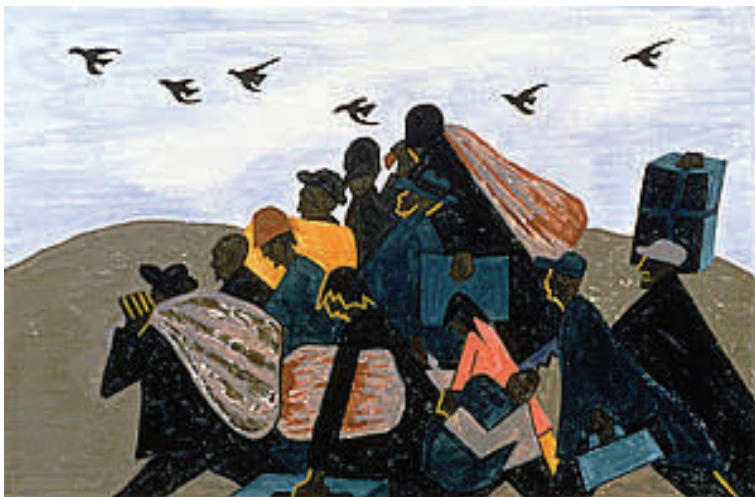
Jacob Lawrence, The Migration of the Negro, Panel 3, 1940-1941