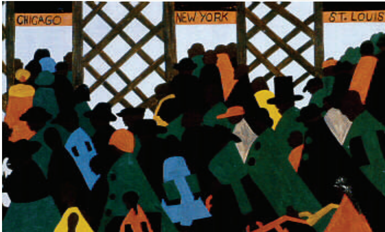
Jacob Lawrence, The Migration of the Negro, Panel 1, 1940-1941

Jacob Lawrence's The Migration of the Negro, Panel No. 1 (1940-41). "There is absolutely nothing before them on the farm," said a government report on Southern labor, "no prospect...but to continue until they die." Instead, they fled.