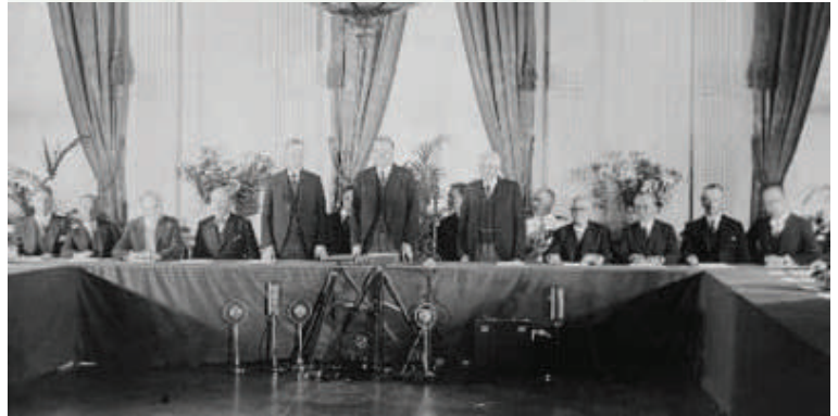
Calvin Coolidge, Herbert Hoover, and Frank B. Kellogg, standing, with representatives of the governments who have ratified the Treaty for Renunciation of War (Kellogg-Briand Pact), in the East Room of the White House

At about the same time, American investors asked President Coolidge to send troops into Mexico when its government threatened to take over foreign-owned oil and mining companies. Coolidge chose to negotiate instead, and the United States reached a settlement with Mexico.