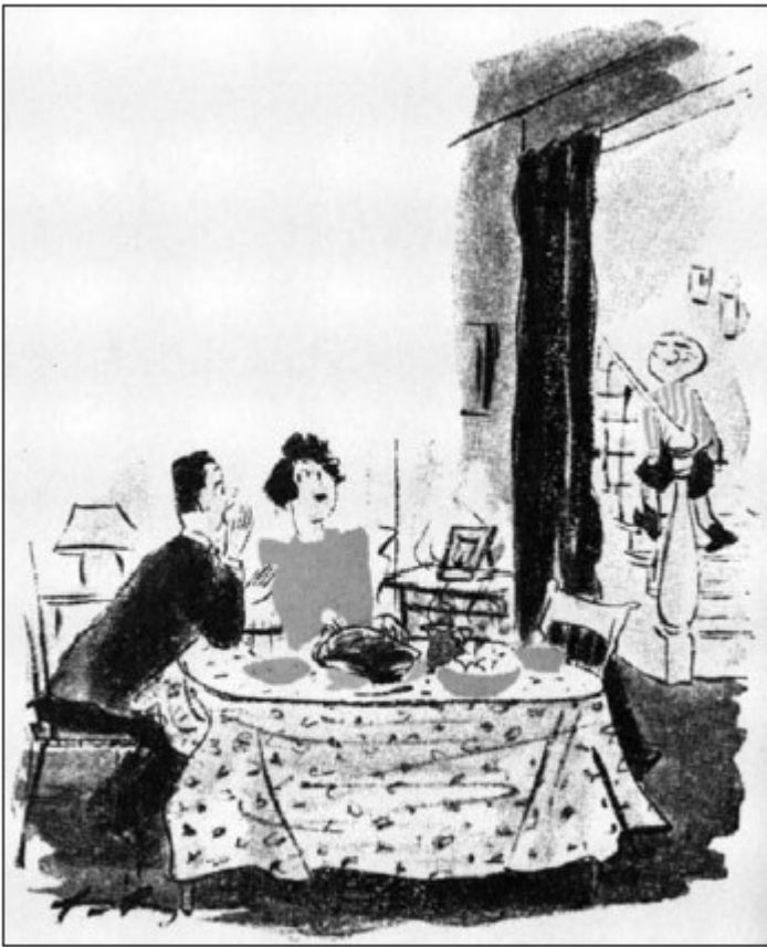
“We saved thirteen points sending Junior to bed without his supper.”

7. Which feature of life on the home front during World War II is most clearly illustrated by this 1944 cartoon?