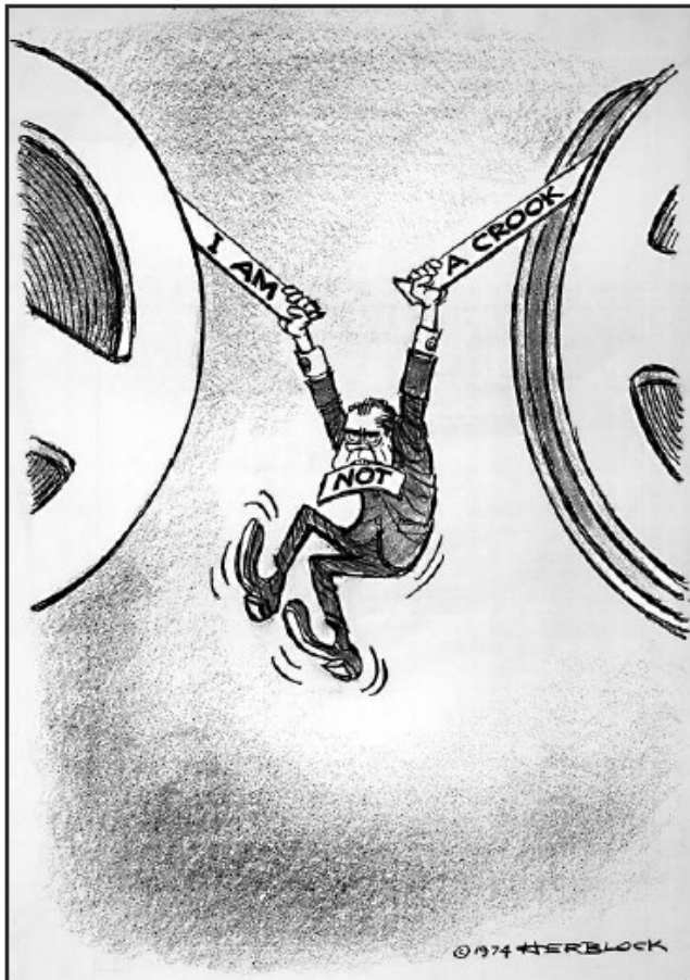
Source: Herblock, "I am Not a Crook," The Washington Post , May 24, 1974

8. The cartoon is most closely associated with the controversy over the