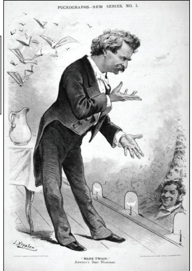
Writer and humorist, Mark Twain, wrote the novel The Gilded Age ridiculing Washington D.C. and many of the leading figures of the day

2. Look up the terms below create a definition that is in your own words.