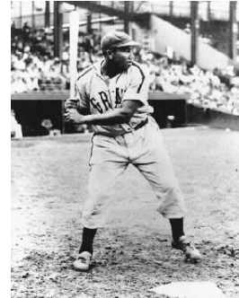
Baseball's Negro Leagues: Josh Gibson- Breaking the Color Line: 1860's - 1947

With the store's 7th Avenue expansion complete in 1924, Macy's Herald Square became the "World's Largest Store", with over one million square feet of retail space.