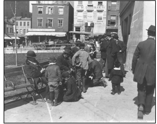
Newsboys and Boot Blacks on Mulberry Bend, N.Y., 1898