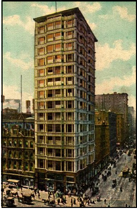
Reliance Building, Chicago, 1894.

2. Using the photos below explain which change in the new cities it shows and what effect the change had on peoples lives.