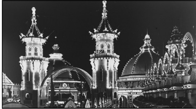
Prints and Photographs Luna Park, at Coney Island, Brooklyn, 1906